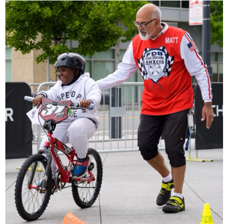
Child with new bike learning to ride it.