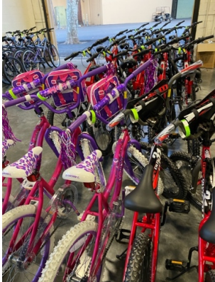
Bikes staged for charities.