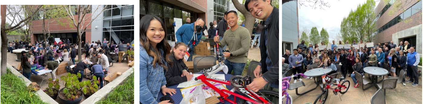
Photos from a Team Building Bike Build hosted by Workday in Pleasanton where about 70 employees assembled 17 bikes.

There were 472 employees involved from the companies who assembled 263 bikes. The income from the 14 Team Building Bike Builds covered the cost of the bikes and helmets, plus donations to the general fund that went a long way toward enabling KBL to purchase the new bikes for the Big Bike Build.