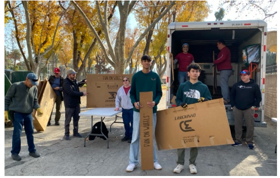
Green team recycling the cardboard boxes.