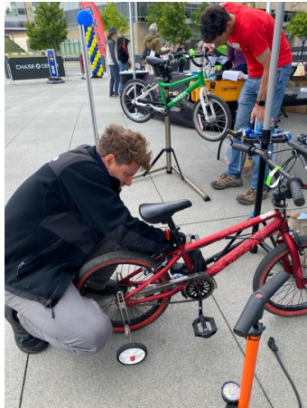
Mechanic repairing a bike