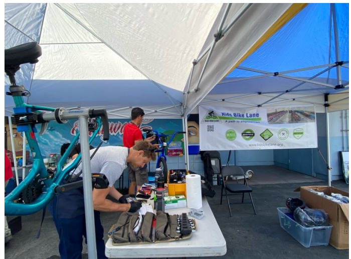
Repair clinic sponsored by the Hayward School district.