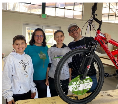
Volunteers of all ages were involved in the morning and afternoon shifts of bike builders.