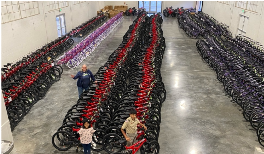
Some of the 604 bikes ready for pick up by 22 charities.

Kids Bike Lane is a non-profit organization that partners with charities, community groups, civic organizations, corporations, and individuals to provide new and refurbished bikes for under-served youth toward the goal of empowering them to live a healthy and active lifestyle.