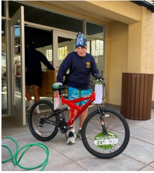
Moving bikes to QC.