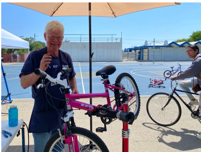
Repair clinic at Mae Nissen Park.

Kids Bike Lane offered four bike repair clinics this year. The sponsors and hosts of the repair clinics were: The Golden State Warriors at the Chase Center, the Hayward School District funded by the Rotary Club of Hayward, the Livermore Connects event at Mae Nissen Park, and in San Ramon as part of the Eagle Scout project.