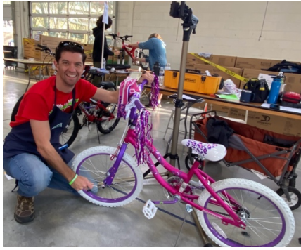
Quality Control mechanic.