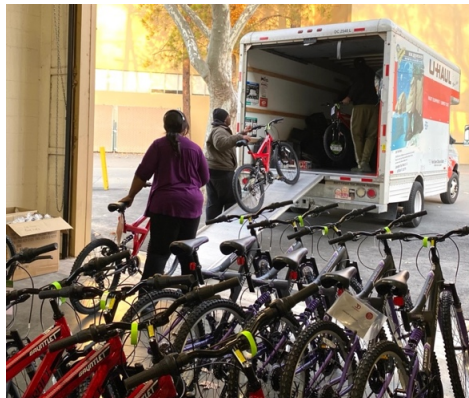
Charities arrive on schedule to pick up bikes.