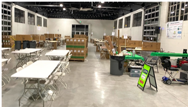
On Friday night and all is ready for the BBB on Saturday.