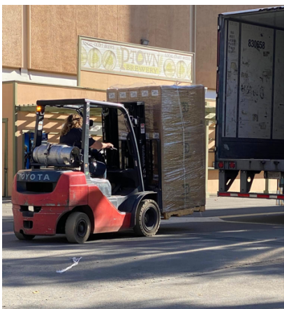
Delivery of 604 bikes.