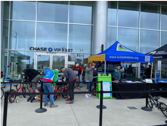
KBL booth at the Chase Center

Kids Bike Lane was invited by the Golden State Warriors to be present for a special event where we provided 36 new bikes and helmets for underserved children San Francisco and to conduct a Free Bike Repair Clinic for children in the neighborhood. The Warriors also paid for 100 helmets that we gave to kids and adults in need of a helmet. The event was held at the Chase Center on a beautiful summer day. In addition to the 36 new bikes KBL gave a few refurbished bikes and helmets to youth who needed bikes to get to school and ride with their friends.