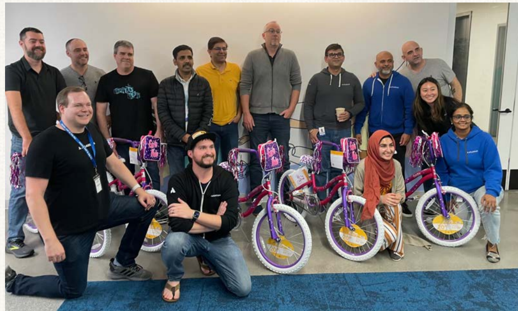
Atlasian December Event