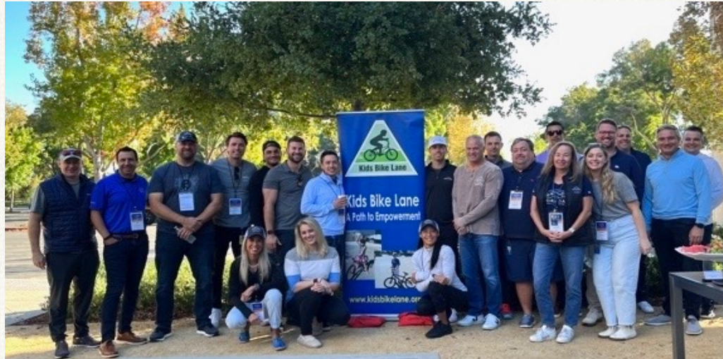
Workday September Event