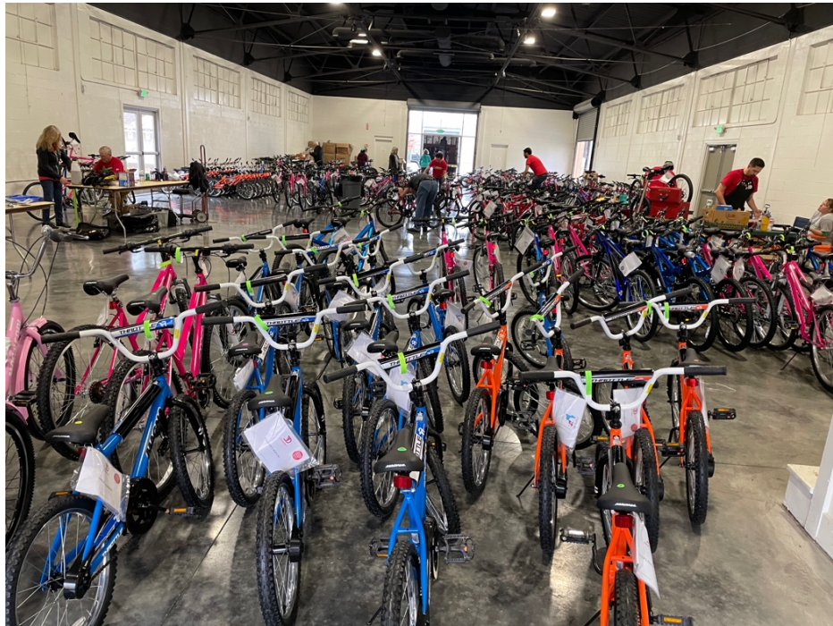
Some of the 553 bikes ready for delivery to 19 charities.

Kids Bike Lane is a non-profit organization that partners with charities, community groups, civic organizations, corporations, and individuals to provide new and refurbished bikes for under-served youth toward the goal of empowering them to live a healthy and active lifestyle.